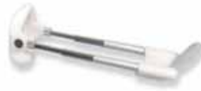
Andro-penis stretcher device