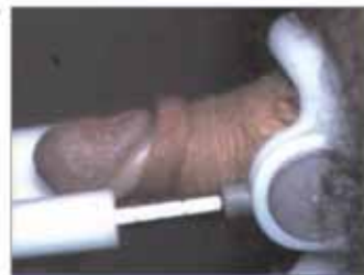
Patient with the device in place