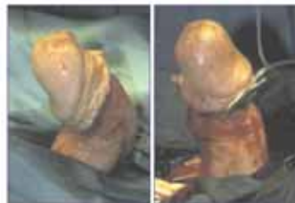
Before and after Essex's plicature showing shortening of the penis

Length and girth of the penis were measured before and after surgery and subsequently after the use of the penile extender. HRQOL was also determined using the SF-36 survey to compare both groups of patients.